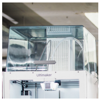
S5 Air Manager

Ultimaker S5 3D printer is required for use